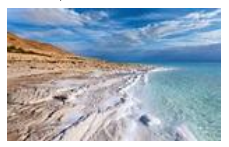
Day 5: Friday 12<sup>th</sup> June 2026 Masada, Qumran and The Dead Sea

We drive South roughly following the River Jordan, to Qumran where the Dead Sea Scrolls were discovered after which we head to Masada , the famous rock fortress, the final resistance of the Zealots against the Romans in the Jewish War of the 1st Century AD. After a relaxing time floating on the waters of the Dead Sea (the lowest point on earth), we head back to the stunning city of Jerusalem .